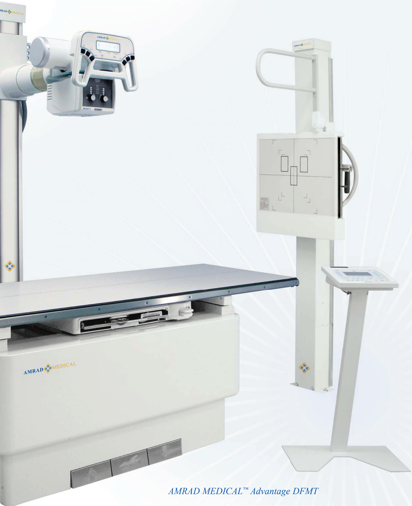
AMRAD MEDICAL™ Advantage DFMT