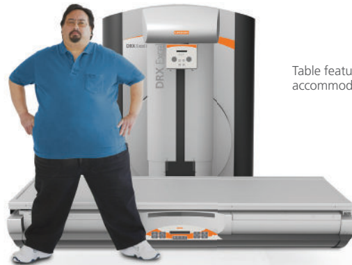
Table features a 265kg weight capacity to accommodate heavier patients.