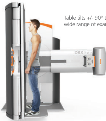
Table tilts +/- 90° to accommodate a wide range of exam types.

The DRX-Excel Plus offers an advanced, remote-controlled table with exceptional flexibility for a wide range of applications. Its ergonomics and efficiency optimize the entire examination process – with convenience for the operator and a low-stress, comfortable experience for the patient.