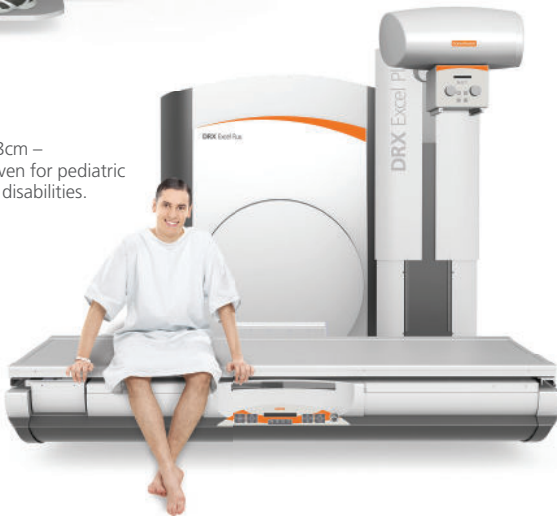
Table lowers to 48cm – easily accessible even for pediatric and patients with disabilities.