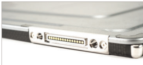
Magnetic connection for docking and charging.