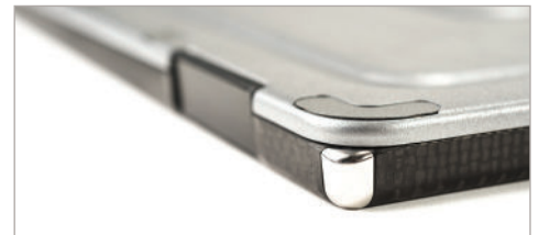
Austenite corners protect against scratches and cracks.