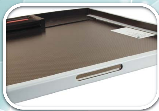
Custom Utility Ports