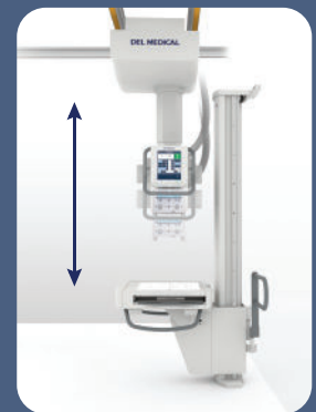
▶ SID track to wall stand