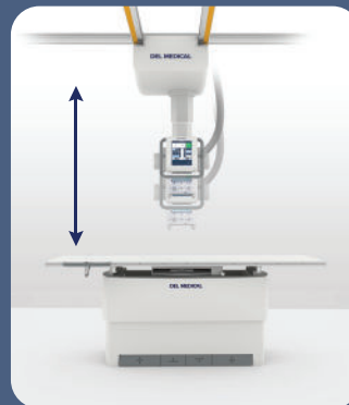
▶ SID track to table

Synchronized motorized movement of the tube crane's vertical axis maintains precise centering between the X-ray tube and image receptor. Available functions include vertical tracking to the wall stand, SID tracking to the elevating table, or horizontally positioned wall stand. The result is quick, accurate alignment without the extra time and effort needed to make additional manual adjustments.