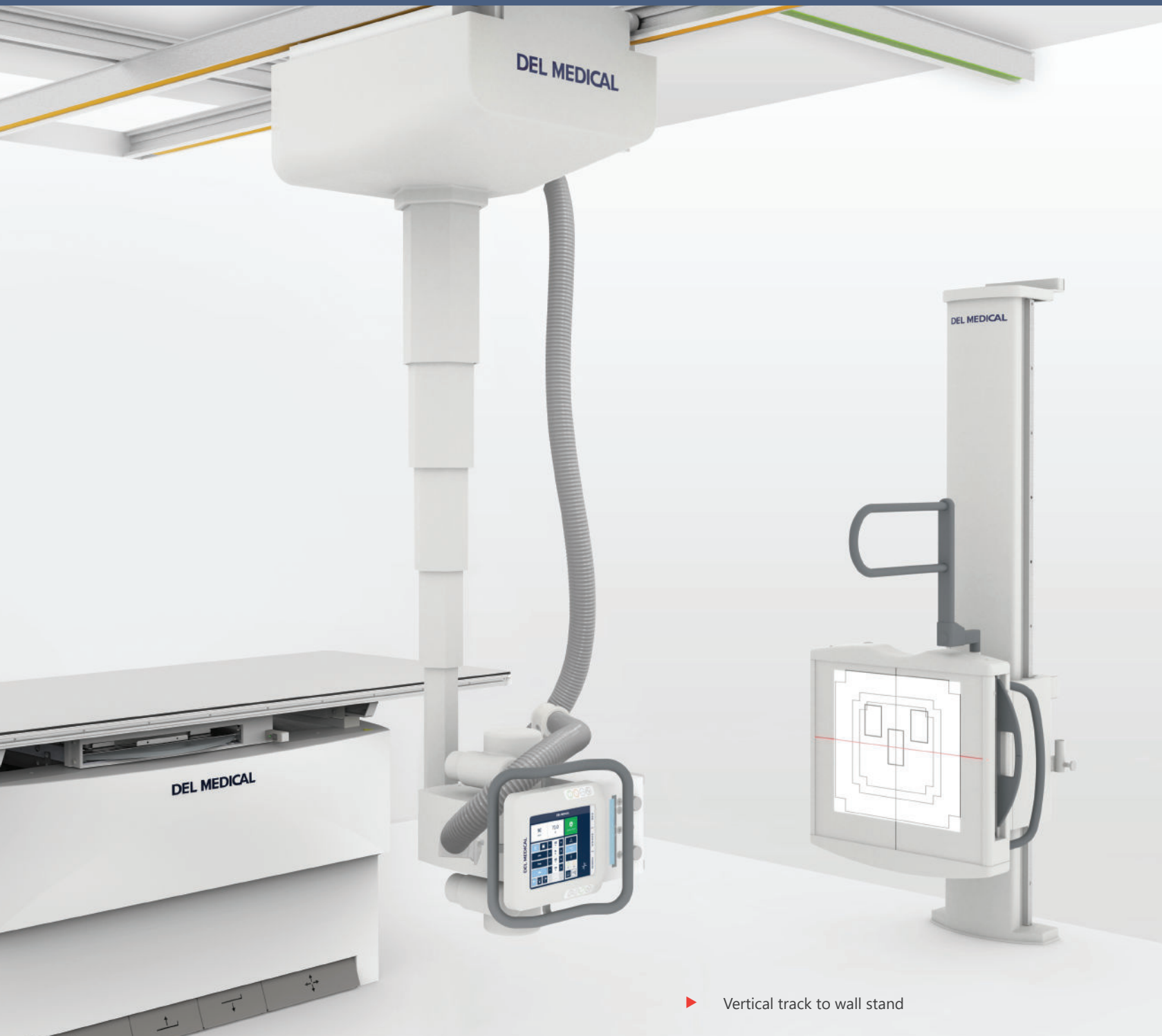
▶ Vertical track to wall stand