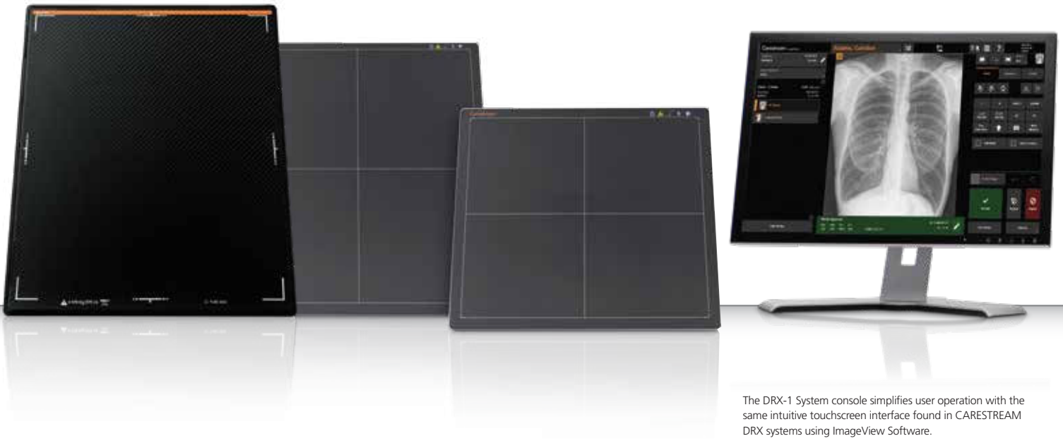
The DRX-1 System console simplifies user operation with the same intuitive touchscreen interface found in CARESTREAM DRX systems using ImageView Software.