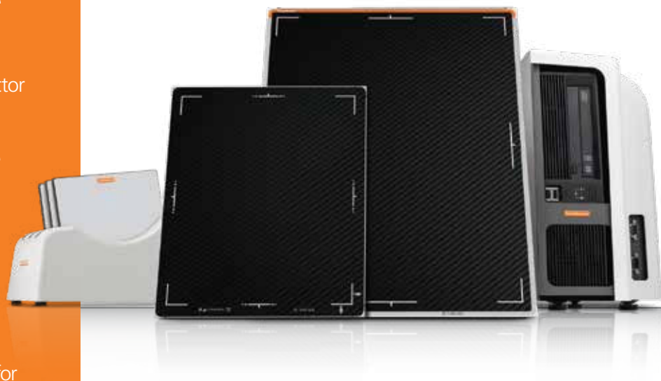
The DRX Detector and the Lux Detector battery charger simultaneously recharges up to three detector batteries.

The DRX-1 System is designed to help optimize the imaging equipment you're using right now. It's compatible with any X-ray system that uses ISO 4090-compliant 35x43, 43x43 and 25x30 cm cassettes – so there's no need to modify your generator or Bucky, discard your wallstand or table, or radically alter your procedures. And, the DRX-1 System can be installed in your exam room in just one day.