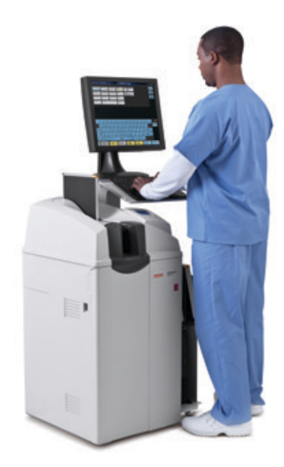
Ideal for use with CARESTREAM DIRECTVIEW CR Systems

The DRYVIEW 5950 Laser Imager is part of the industry's most complete diagnostic imaging portfolio. Carestream offers solutions for the entire imaging chain, including Computed Radiography (CR), Digital Radiography (DR), HIS/RIS, PACS, hardcopy digital output and traditional film and screen products. Choosing Carestream as your imaging partner makes it easy and affordable to meet your current needs and build for your future.